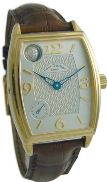
Modell 33 3-dimensional moon