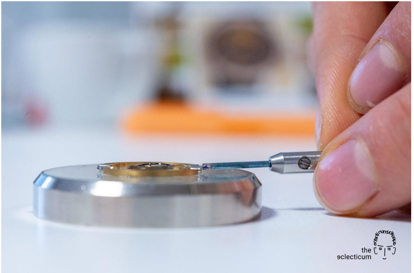
(the screwdriver indicates how little vertical space Anny had for the Breguet spiral)