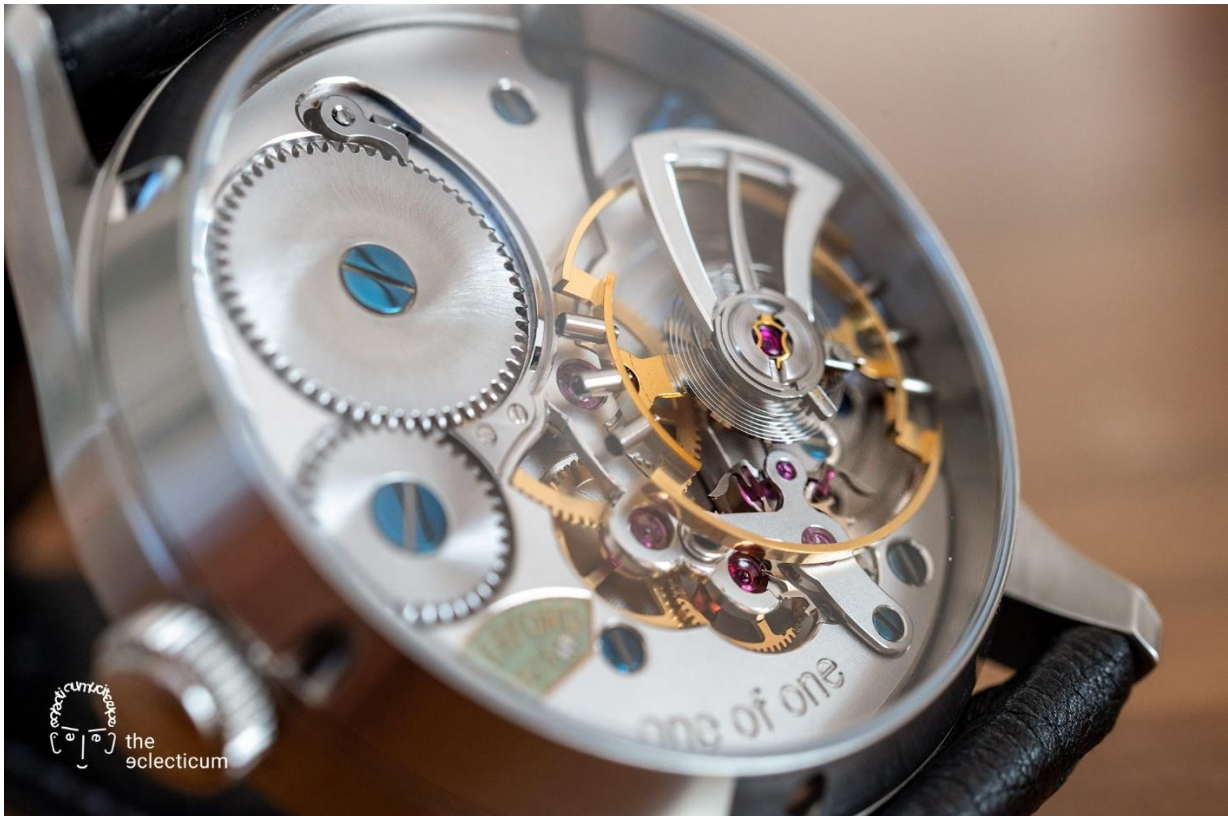
(escapement with large balance and Breguet spring...)