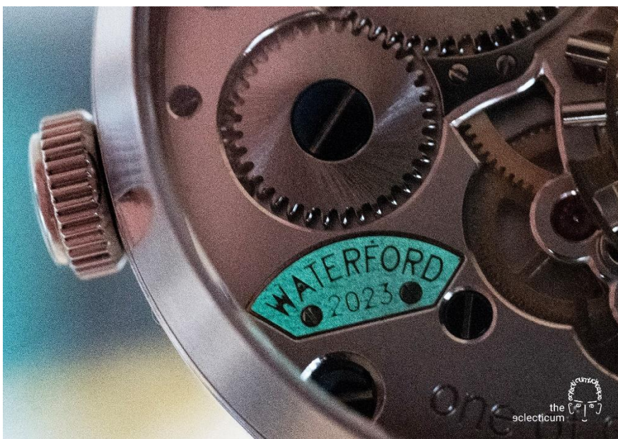
(a glowing 'Waterford'...)

Finally, Paul had the idea to bring a hint of most famous Ireland's heraldic emblem to the piece, a golden harp on green background. But not only this, it had to be done in Paul's typical ironic fashion: a plaquette with a brass 'Waterford 2023' engraving surrounded by green luminous material – the latter an idea from Anny!