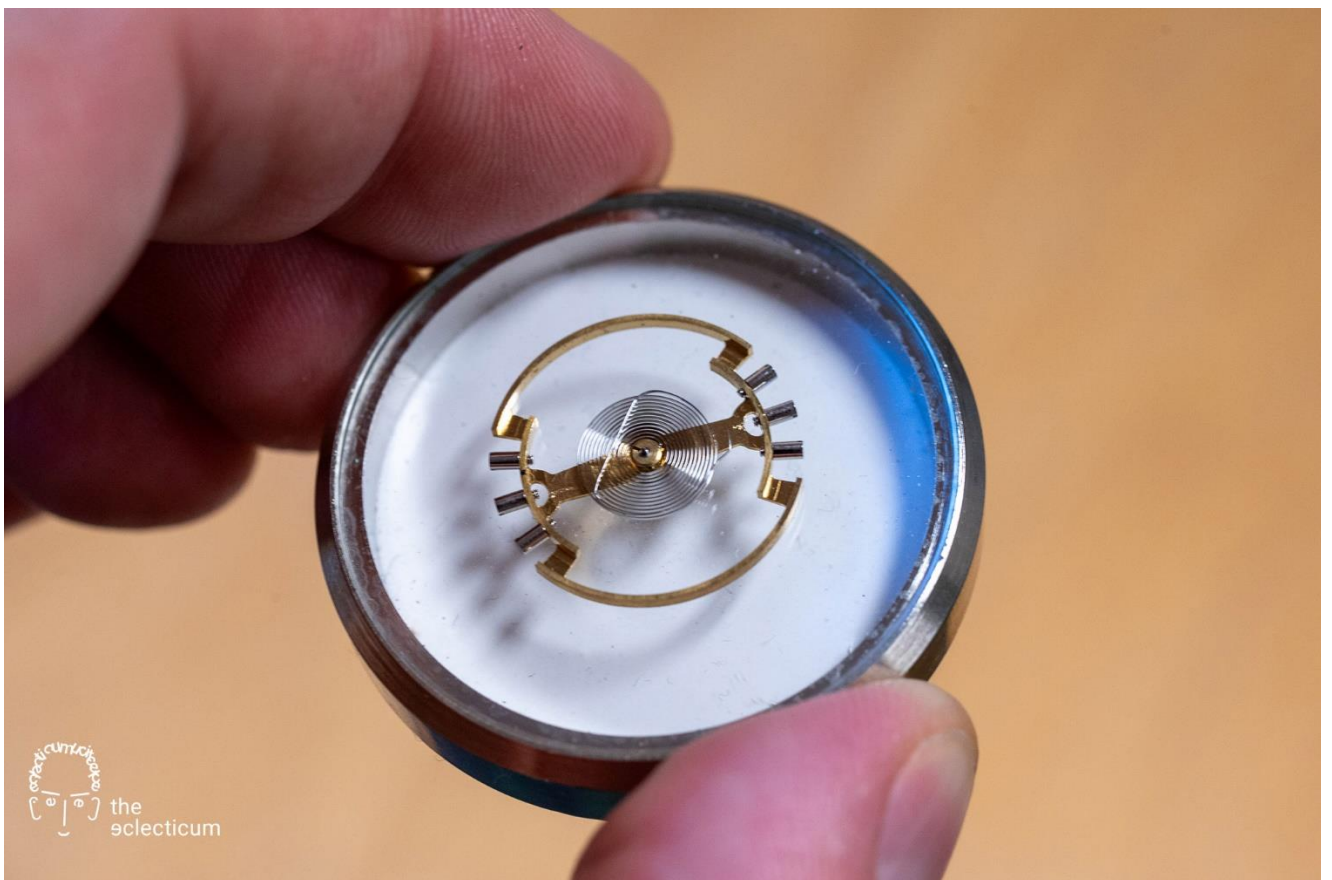
(the large balance complete with Breguet spiral)