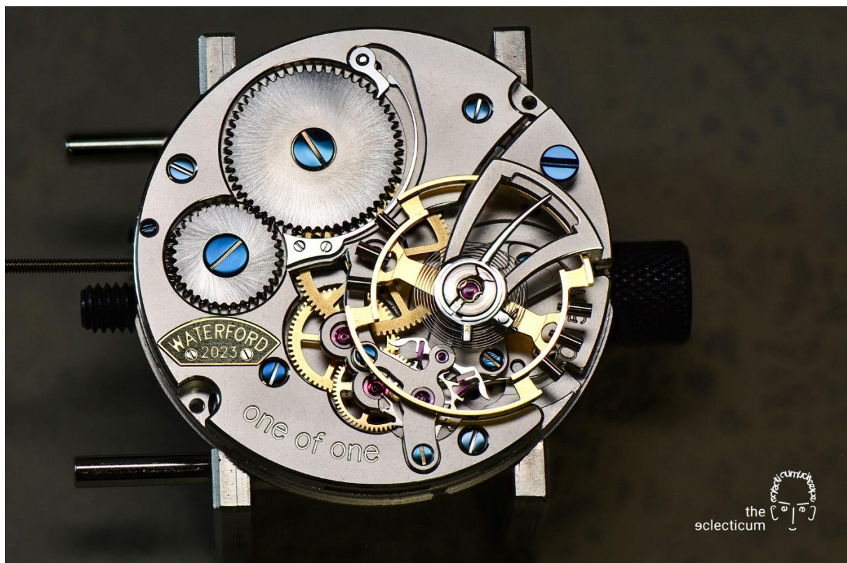
(finished Cal. 55W movement)