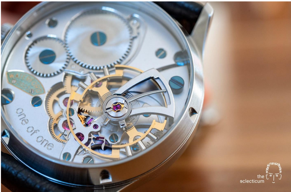
(... and moustache pallet)

This is a timepiece that invites to discover the aesthetic, acoustic and haptic qualities of watchmaking in unusual ways!