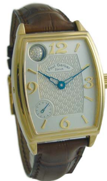
Modell 33 3-dimensional moon