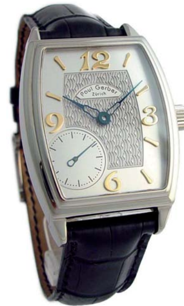
Modell 33 large seconds